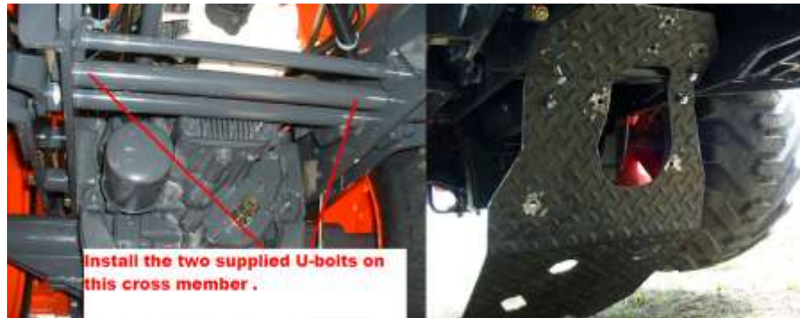
Photo B: For all BX24xx & higher, put the 4-nuts on U-Bolts & leave some play. Some of newer BX, there's small factory skid plate that must be uninstalled. These will require 14mm or a 9/16 wrench/socket to remove it. see next photo..