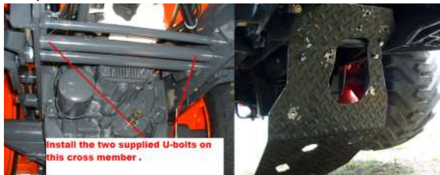
Photo B: For all BX24xx & higher, put the 4-nuts on U-Bolts & leave some play. Some of newer BX, there's small factory skid plate that must be uninstalled. These will require 14mm or a 9/16 wrench/socket to remove it. see next photo.